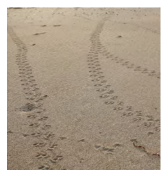
Flatback Turtle hatchling tracks moving towards the sea (top of photo), with bird tracks seen in the foreground.