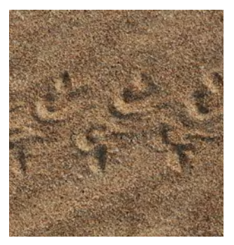
Flatback Turtle hatchling track. Direction of travel is from right to left of the photo.