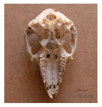
Northern Brushtail Possum upper skull (underside view). Shown at 50% of actual size.