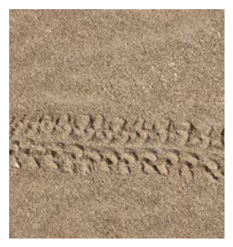
Flatback Turtle hatchling track (flippers not fully unfurled). Direction of travel is from right to left of the photo.