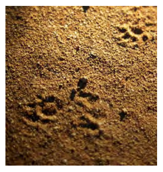
Northern Brushtail Possum front prints in sand. Note that only the front feet (and evenly-spread toes) are distinctive in this print due to the soft nature of the sand.