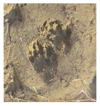
Northern Brushtail Possum footprints in damp sand. Note the distinctive toe on the hind foot which is turned out at an angle.