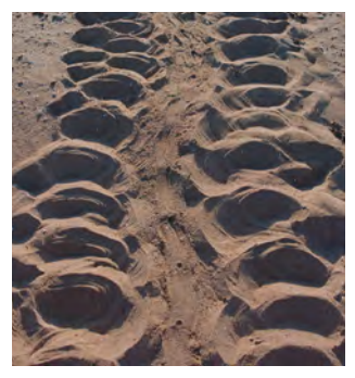
Adult Flatback Turtle track. Direction of travel is towards the bottom of the photo.