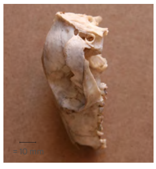
Northern Brushtail Possum upper skull (left side view). Shown at 50% of actual size.